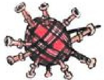
The SCOTTISH VARIANT At least you can hear it coming.

This year in Scotland, they've scheduled over 60 Highland Games - from Carmunnock in the lowlands below Glasgow to Durness in the northwest. Covid had disrupted so many, but they're back! The Highland Games occasion dates back to the 4 th century AD. The Games were originally a contest of strength designed "as a means of selecting the most able men for soldiers and couriers." To this day, they are seen as an expression of ultimate 'Scottishness'. With Bagpipes, Highland dancing, whiskey tasting, that beloved tug o' war, music and brute strength competitions, they all feature as an ongoing tribute to Scotland.